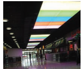
Galleria North Mall, Hatfield, Middlesex