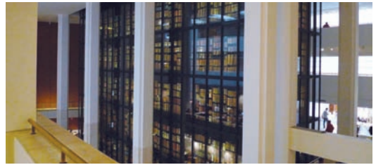
The British Library – Kings Tower – sustainable LED lighting