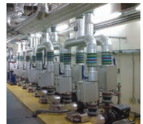
Metropolitan Police – Marlowe House, Sidcup