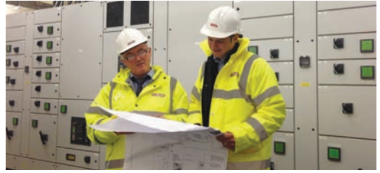
HV/LV submain distribution and control